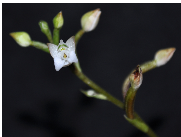
Fig. 2: Ponthieva luegii

a: plant – b: dorsal sepal – c: lateral sepal – d: petal – e: labellum – f: column (drawing: F.Archila)