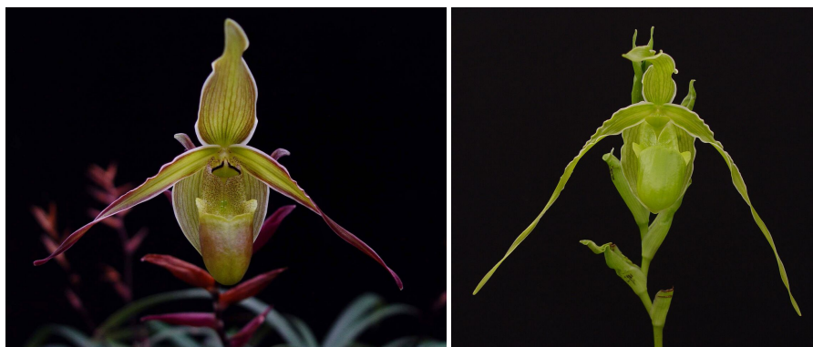
A B Fig. 7: Phragmipedium longifolium A. f. roezlii B. f. album

Hooker, J.D., 1876. Cypripedium roezlii . Curtis's Botanical Magazine , 3 rd series, 32, tab. 6217.