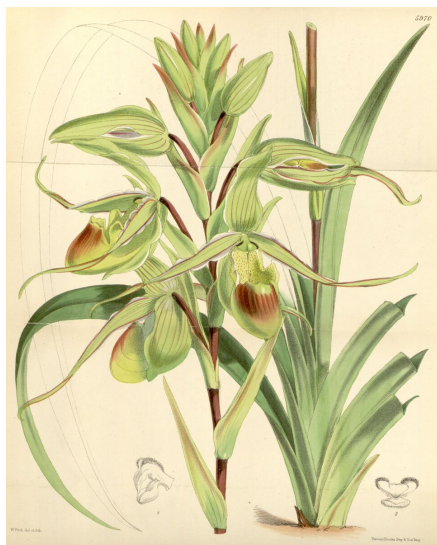
Fig. 3: Cypripedium longifolium from Curtis's Botanical Magazine: t. 5970

His clarifications were embedded in an article entitled " Cypripediums longifolium and Lowii " (Rolfe, 1890) that was published in the Gardeners' Chronicle (3. series, vol. 8[208]: 728-730). Rolfe wrote: