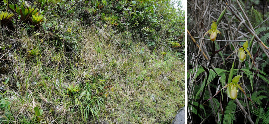
Fig. 5: Phragmipedium longifolium in situ