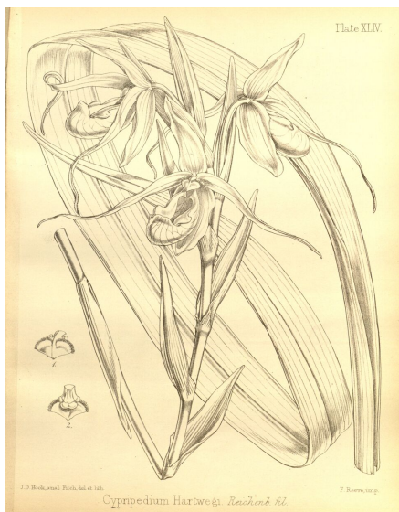
Fig. 1: Cypripedium hartwegii from Seemann (1852)